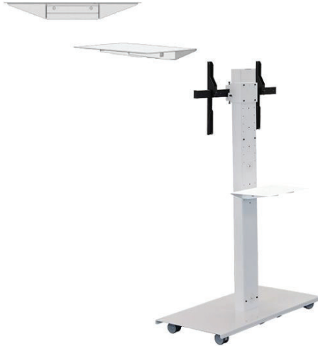
SYZ1 - Laptop Shelf (W 18.5" / D 13" / H 2.5")

The SYZ Accessories have a series of laptop shelf options to choose from. AVFI's SYZ1, SYZ2, SYZ3, SYZ4 & SYZ5 laptop shelf/arm models allow the keeping of your laptop within arm's reach. These can be mounted on several of the AVFI stands but it will depend on the type of stand you have and your needs.