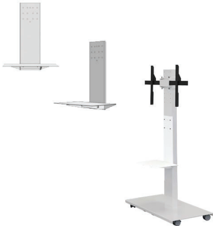
SYZ2 - Laptop Shelf + Extension Plate (W 18.5" / D 13.5" / H 24")

Laptop shelf to be mounted on the back or front of the stand depending on your monitor size. Color: Black or White Metal.