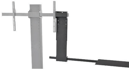
SYZ4 - Laptop Shelf with Hook Bracket (W Min-36" Max-46" / D 10.5" / H Min-26.5" Max-34")

Laptop shelf to be mounted on the bracket bar, used when there is no threaded holes at the back of a stand to be mounted. Color: Black Metal.